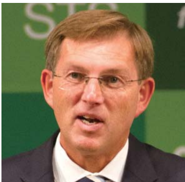
Miro Cerar Prime Minister Government of the Republic of Slovenia, SLOVENIA