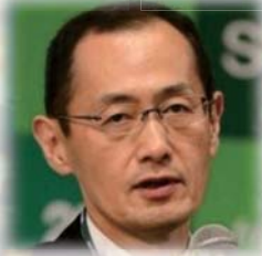
Shinya Yamanaka (Center for iPS Cell Research and Application, Kyoto University, JAPAN) [2012 Nobel Laureate]