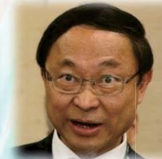
Pichet Durongkaveroj (Minister of Science and Technology, THAILAND)