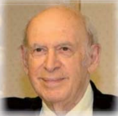
Jerome Isaac Friedman (Massachusetts Institute of Technology (MIT), U.S.A.) [1990 Nobel Laureate]