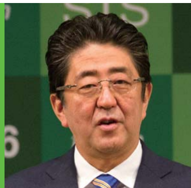
Shinzo Abe Prime Minister Government of Japan, JAPAN