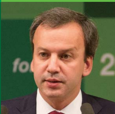
Arkady Dvorkovich Deputy Prime Minister Government of the Russian Federation, RUSSIA