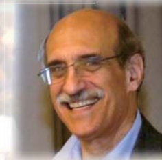
Martin Chalfie (Columbia University, U.S.A.) [2008 Nobel Laureate]