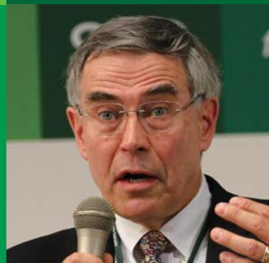
Rush D. Holt, Jr. CEO American Association for the Advancement of Science (AAAS), U.S.A.