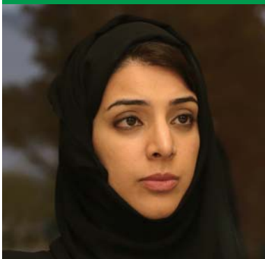
Reem Ebrahim Al Hashimy UAE Minister of State for International Cooperation U.A.E.