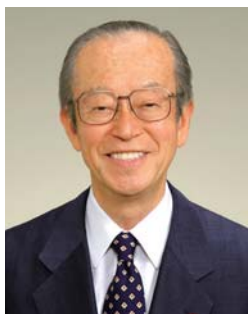
Koji Omi Founder and Chairman STS forum

Science and Technology in Society forum (STS forum ) was established in 2004 by Koji Omi, the former Minister of Finance, the former Minister of State for S&T Policy for Okinawa and Northern Territorial Affairs, and the former Minister of State of Economic Planning, for the purpose of providing a platform to world leaders in the fields of policymaking, academia and industry to gather and discuss how to deal with science and technology issues from a long term-perspective, i.e. 100 years to 500 years, for the future of the humankind.