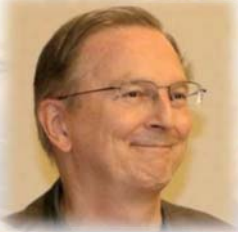
Jack William Szostak (Harvard Medical School, U.S.A.) [2009 Nobel Laureate]